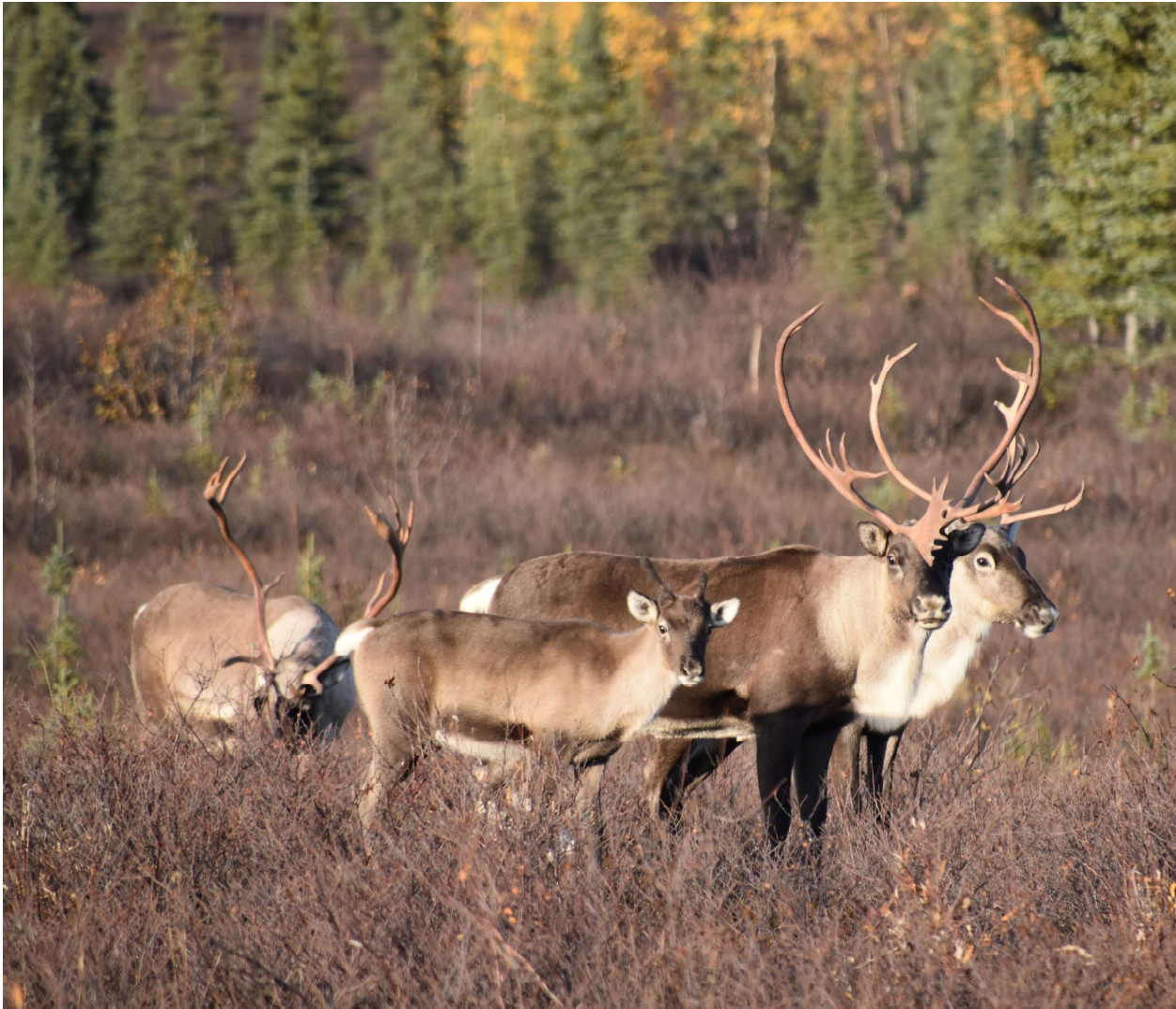
Fig. 2. Caribou in fall range of the Western Arctic Herd of Alaska.

lock away terrestrial forage that overwintering caribou rely upon, impacting body condition and survival. For example, for the Western Arctic herd, an extreme midwinter thaw with rain in December 2005 left many caribou in poor body condition and cow survival declined to 70%.