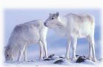
Peary caribou