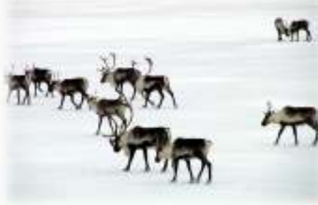
Barren-Ground caribou