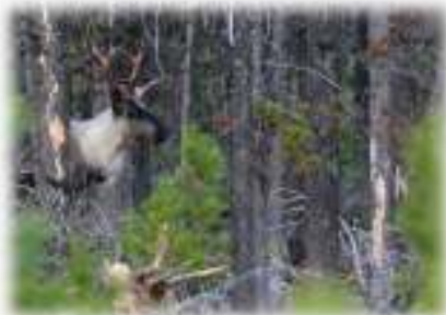
Northern Mountain caribou